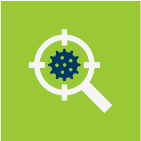
In Vitro Diagnostics